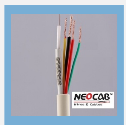
CCTV Camera Control Cable