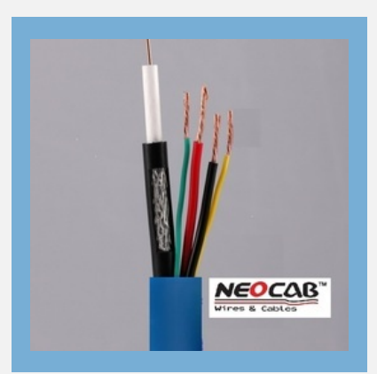
RG59 CCTV Camera Control System Cables