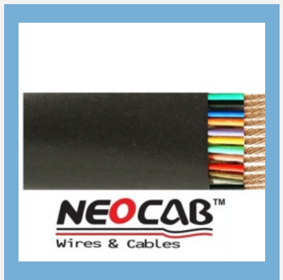
Elevator Cable / Travelling Cable 12 Core