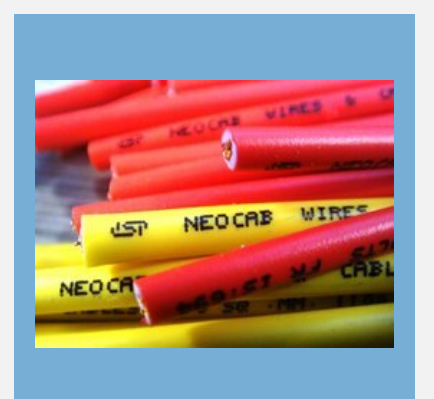
House Electrical Wire