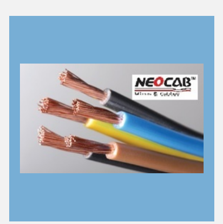
Insulated and Sheathed Cable