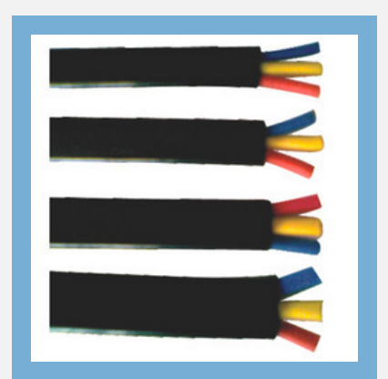
Flat Submersible Cable