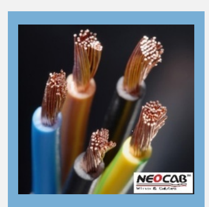
FRLS Sheathed Cable