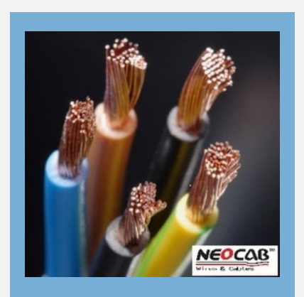
FR And FRLS Building House Wire