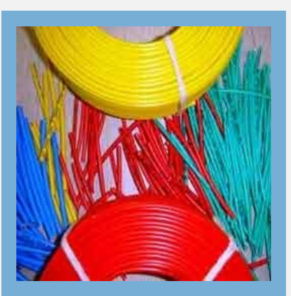
Sheathed Fire Resistant Cables