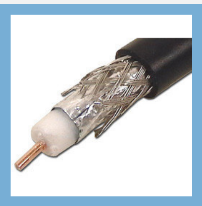
T V Cables