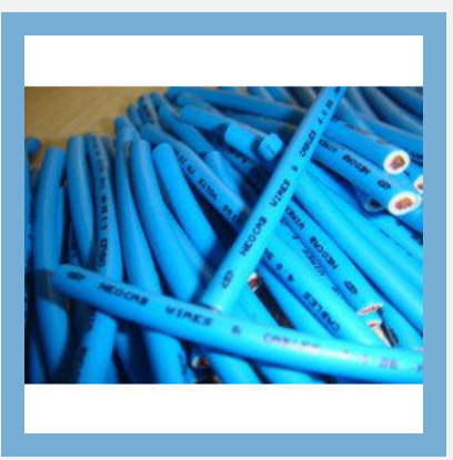
ZHFR LS Insulated Cable